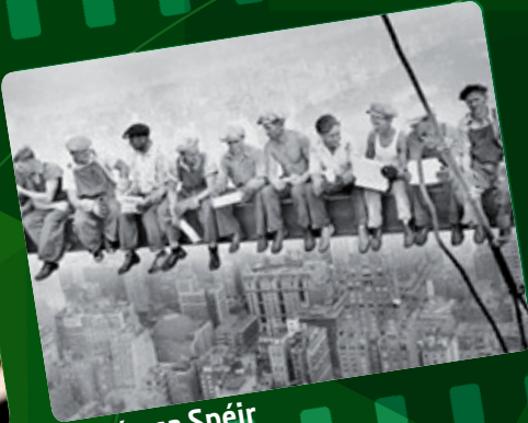
Lón sa Spéir