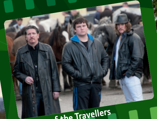
King of the Travellers

The Broadcasting Authority of Ireland is pleased to support the International Association for Media and Communication Research (IAMCR) 2013 Conference