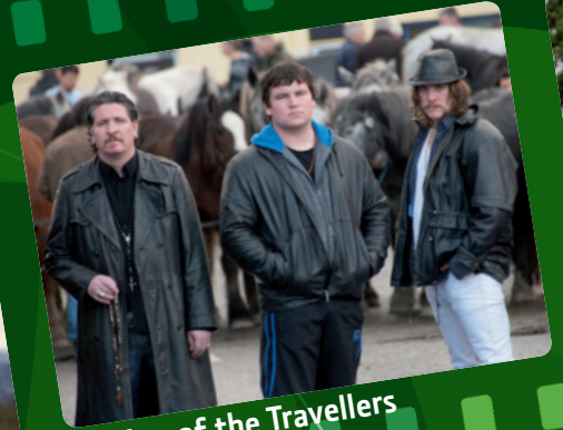
King of the Travellers

The Broadcasting Authority of Ireland is pleased to support the International Association for Media and Communication Research (IAMCR) 2013 Conference