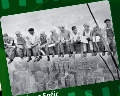
Lón sa Spéir